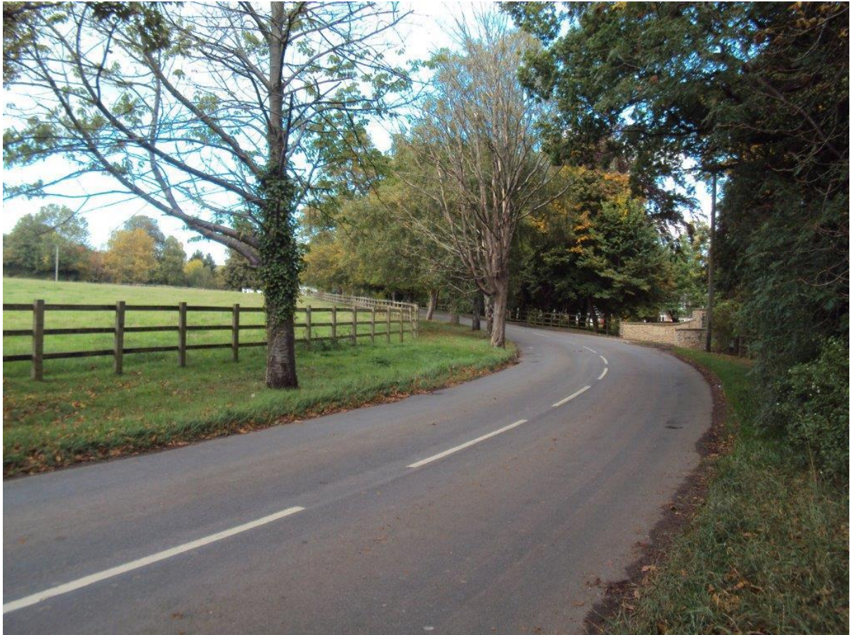
Billesley Road approach to Wilmcote