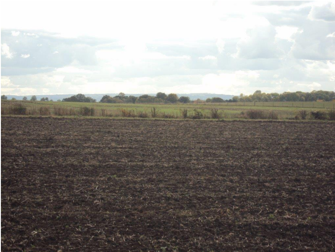
View towards the Cotswold Hills from Featherbed Lane