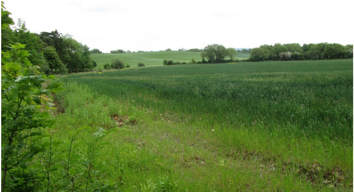
Along Billesley Road looking towards the East