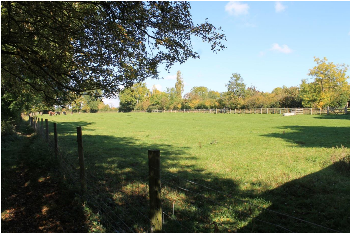
View to the rear of Mary Arden's House