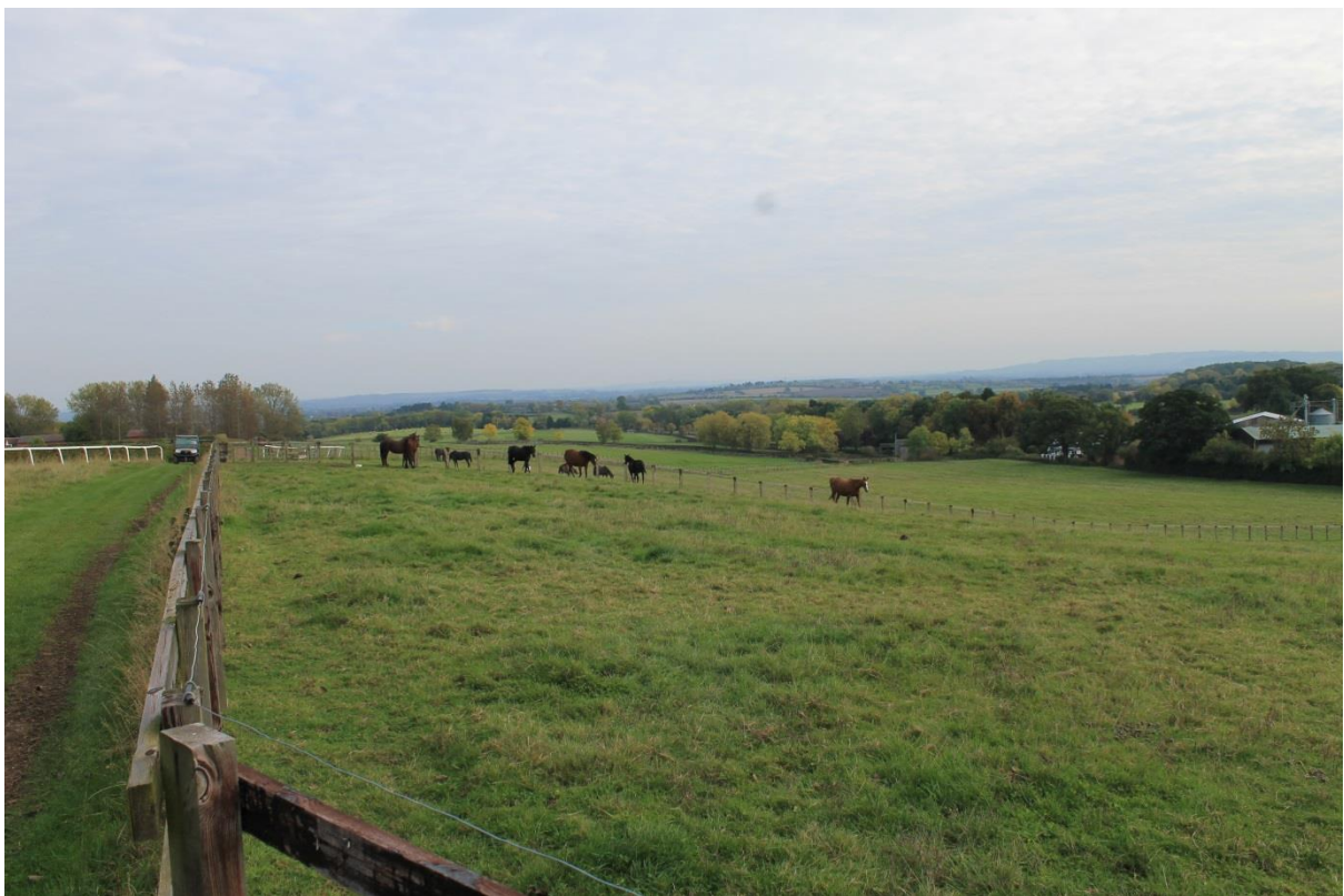
Open countryside views from the Gallops to the South