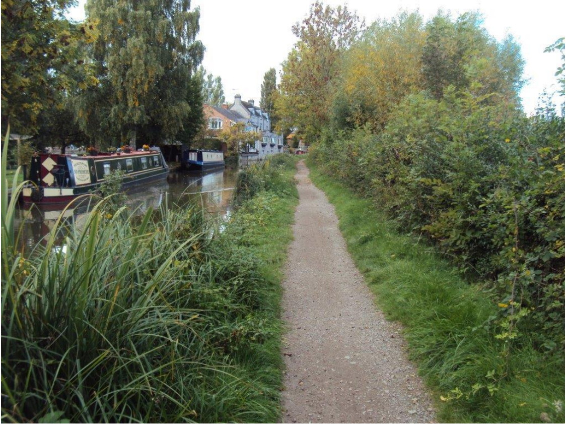
Canal towpath towards Henley in Arden