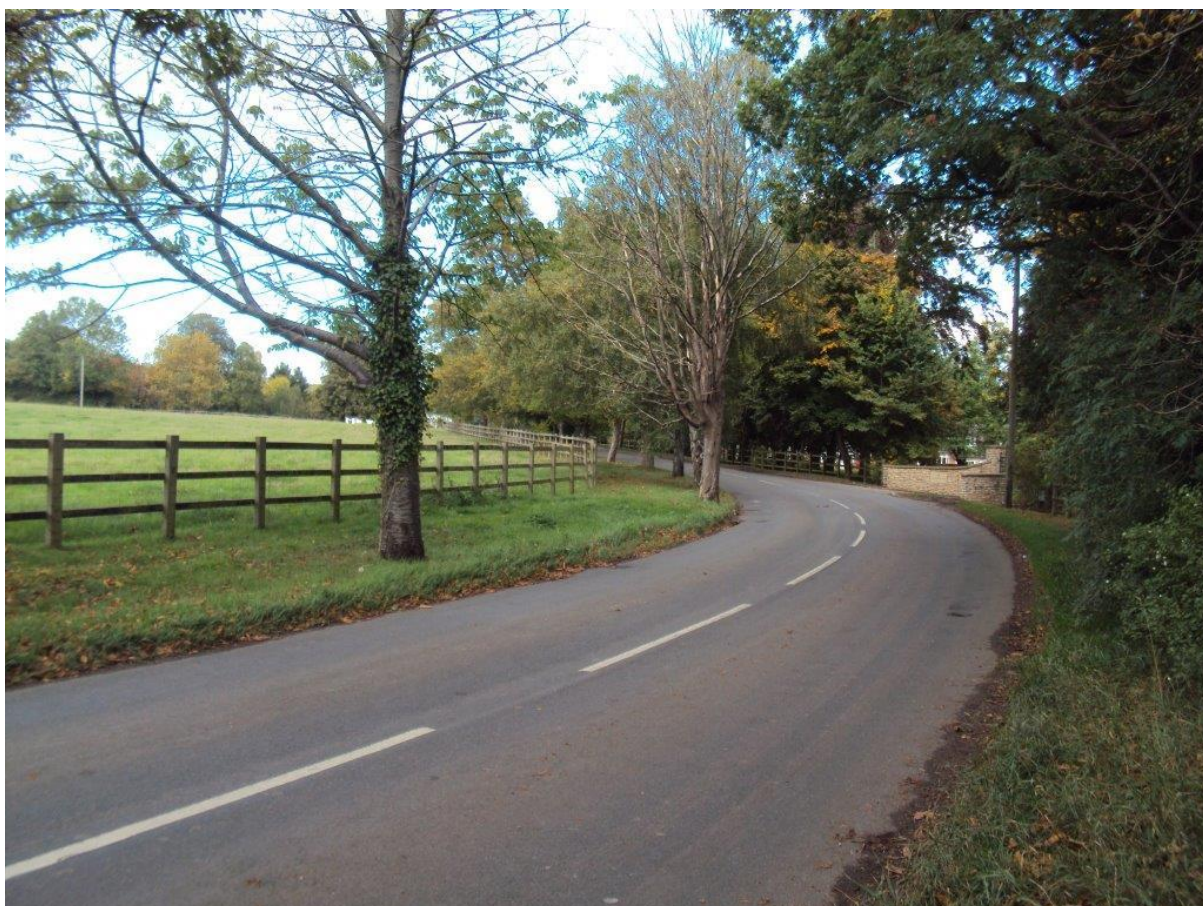
Billesley Road approach to Wilmcote