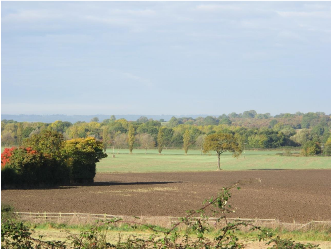
View from Pathlow looking North-West towards the Railway Line and the canal