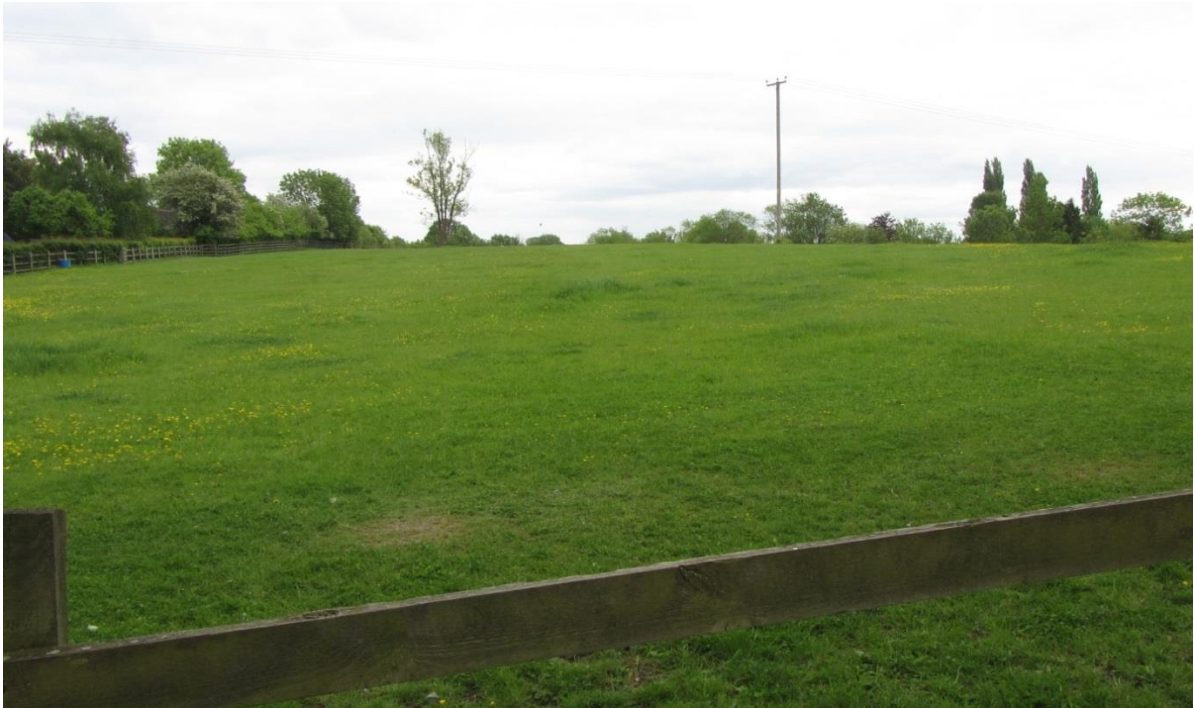
View from Featherbed Lane across the field between the Railway Station and the canal