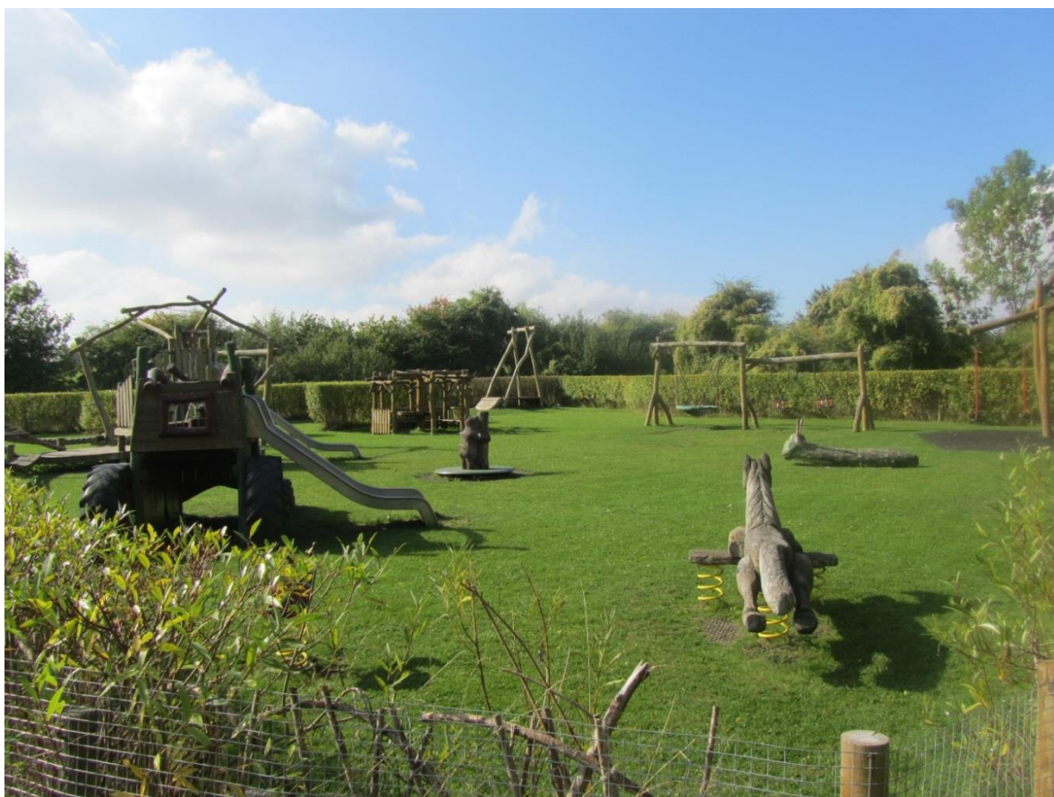
Willow Wood Play Area

A valued part of Wilmcote village, with play equipment for a variety of ages, surrounded by willow hedging and gates.