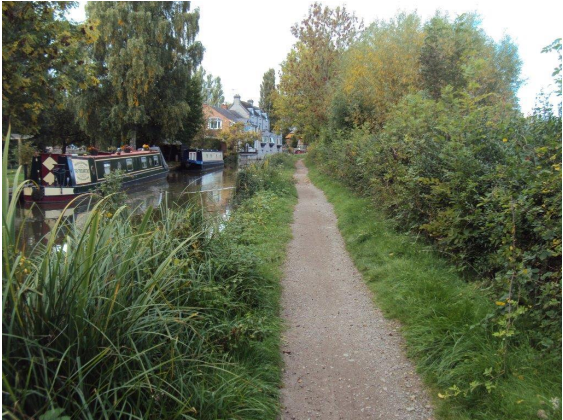
Canal towpath towards Henley in Arden