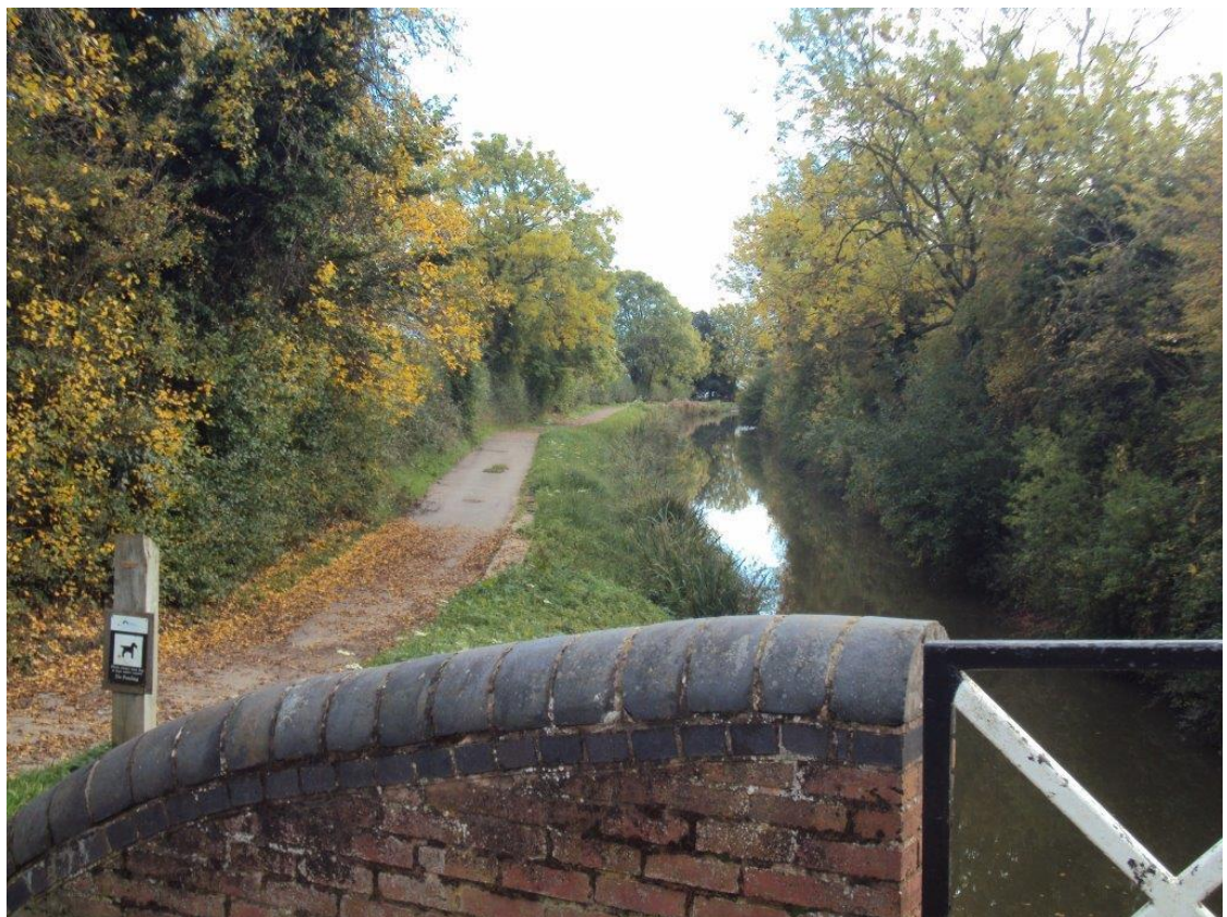
Canal towpath towards Stratford-upon-Avon