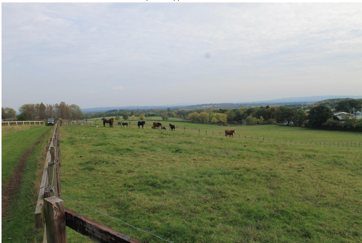
Open countryside views from the Gallops to the South