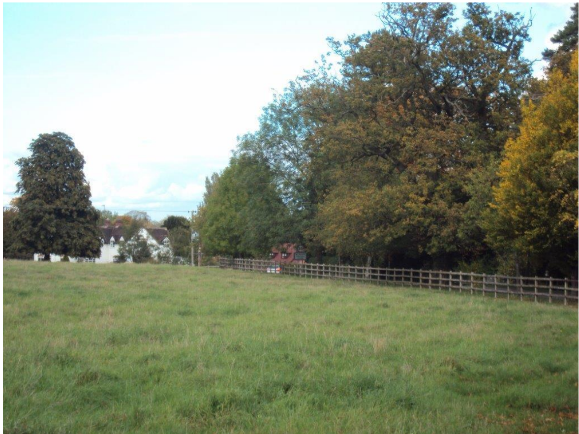
Church Road approach to Wilmcote