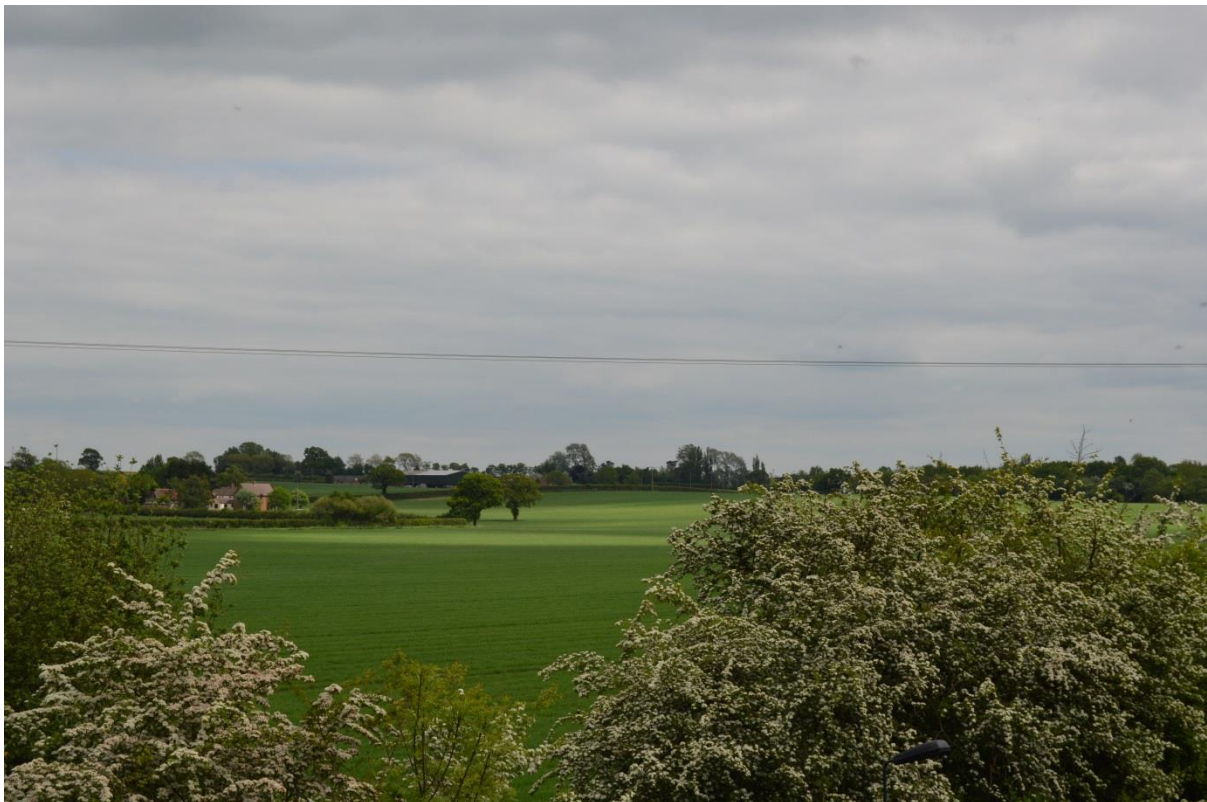
View from the Railway Station footbridge towards the South-East.