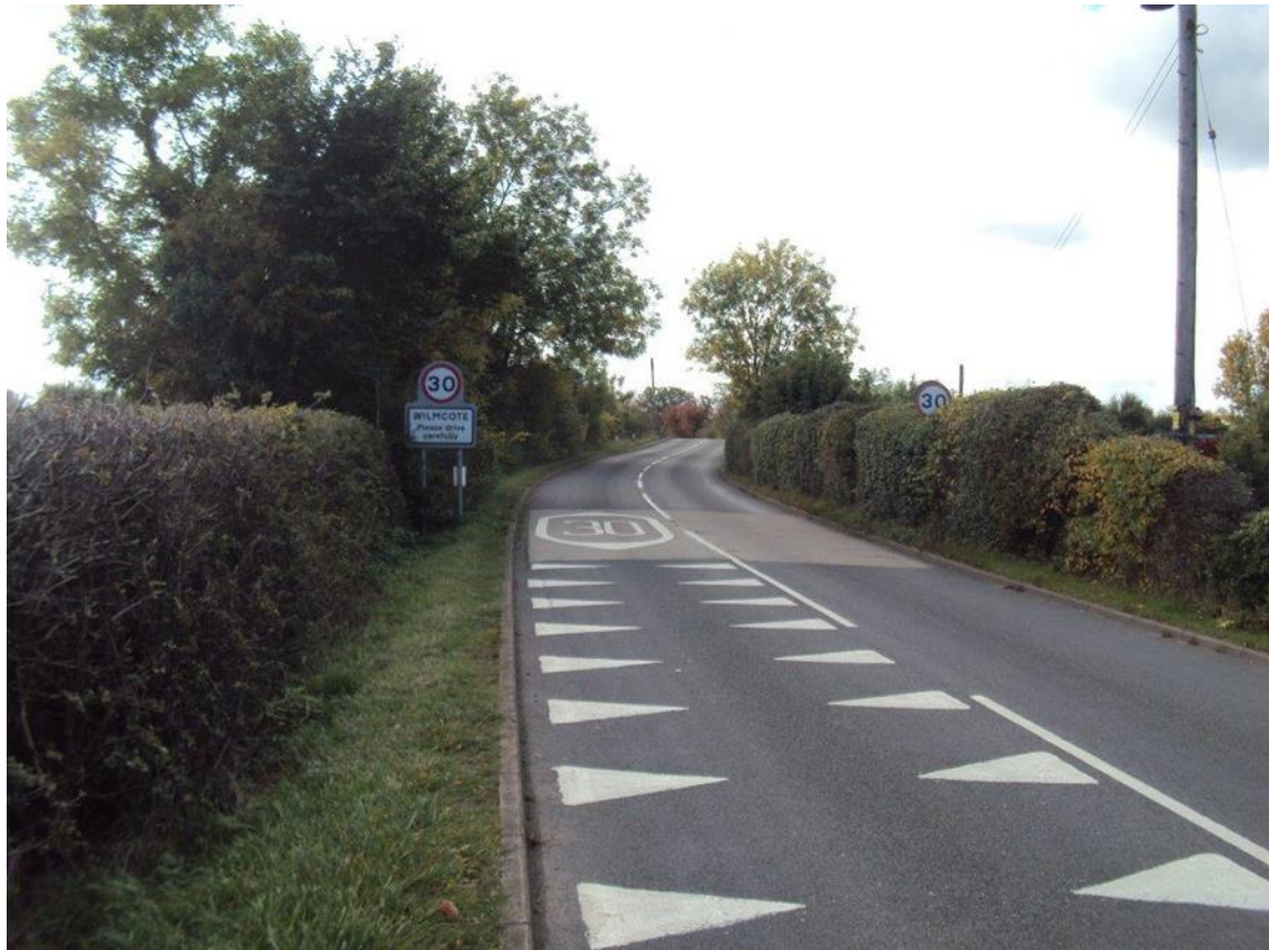
Featherbed Lane approach to Wilmcote, ahead is the Railway Bridge.