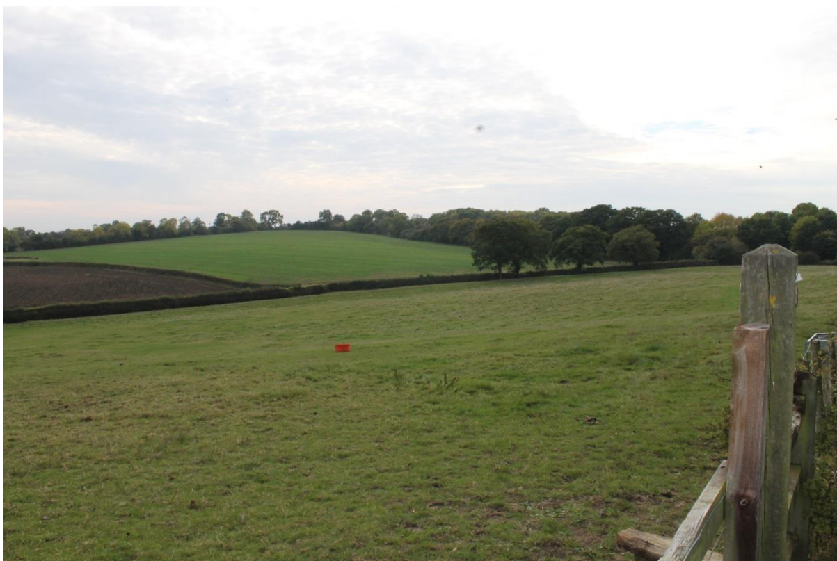
Open countryside views from the Gallops to the West