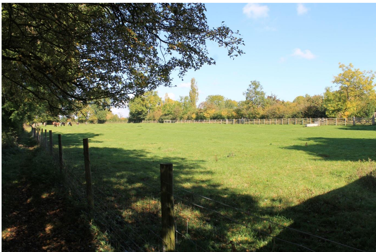
View to the rear of Mary Arden's House