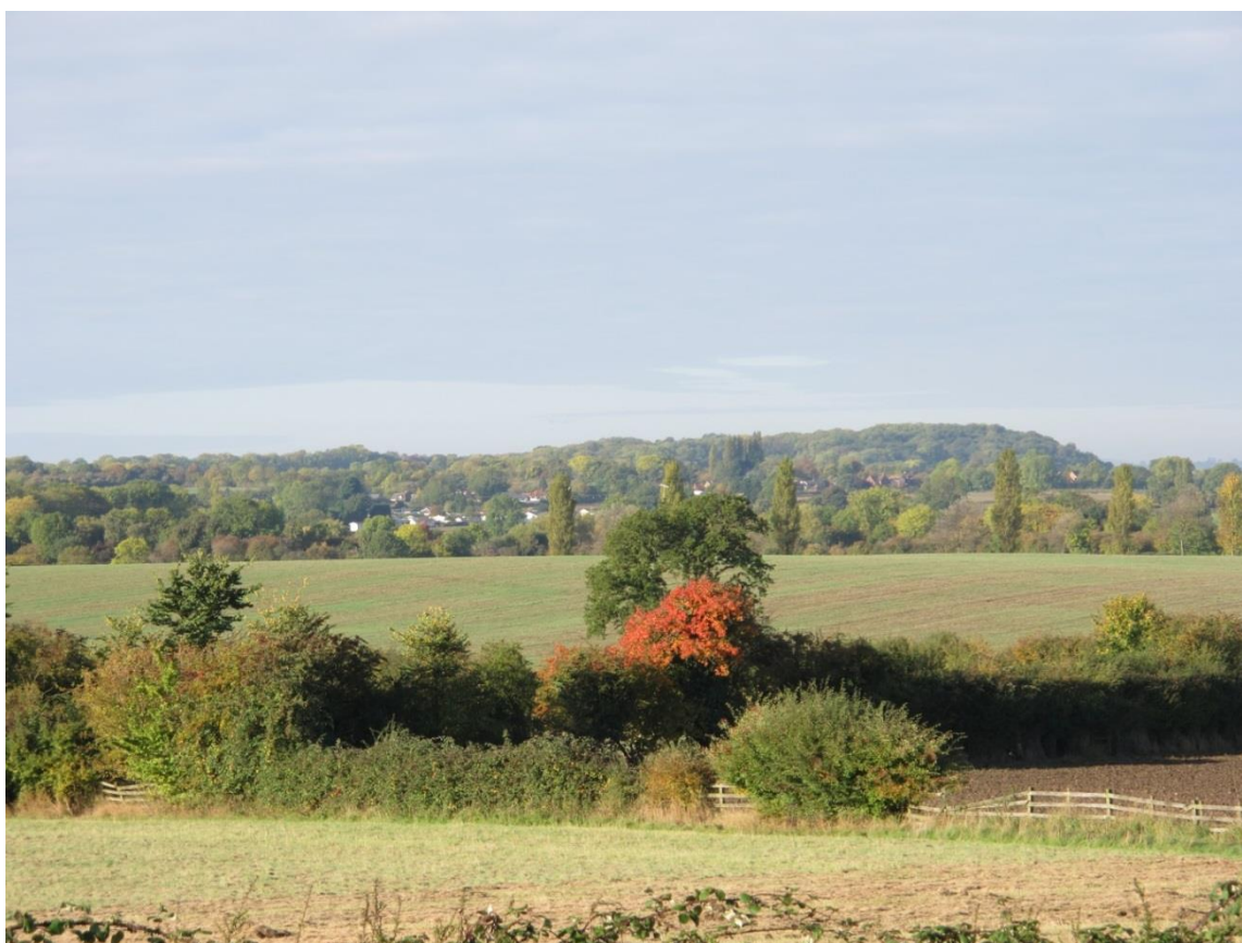
View from Pathlow looking West towards Wilmcote village.