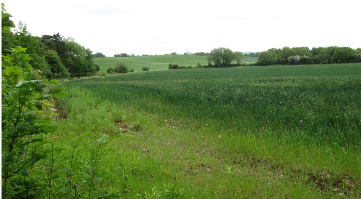
Along Billesley Road looking towards the East

A valued part of Wilmcote village, with play equipment for a variety of ages, surrounded by willow hedging and gates.