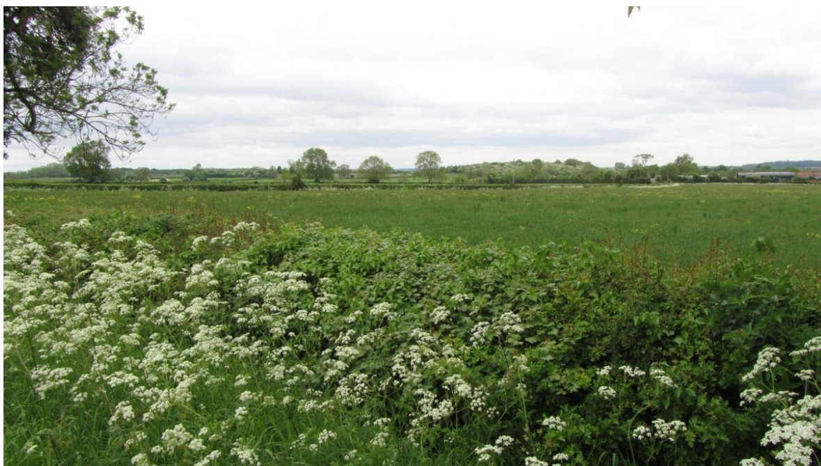
Approach to the village along Aston Cantlow Road (part of the National Cycle Route 5) with open views to the North and North West across the historic farmstead of Gypsy Hall Farm and views beyond of the forested hills of Wootton Wawen