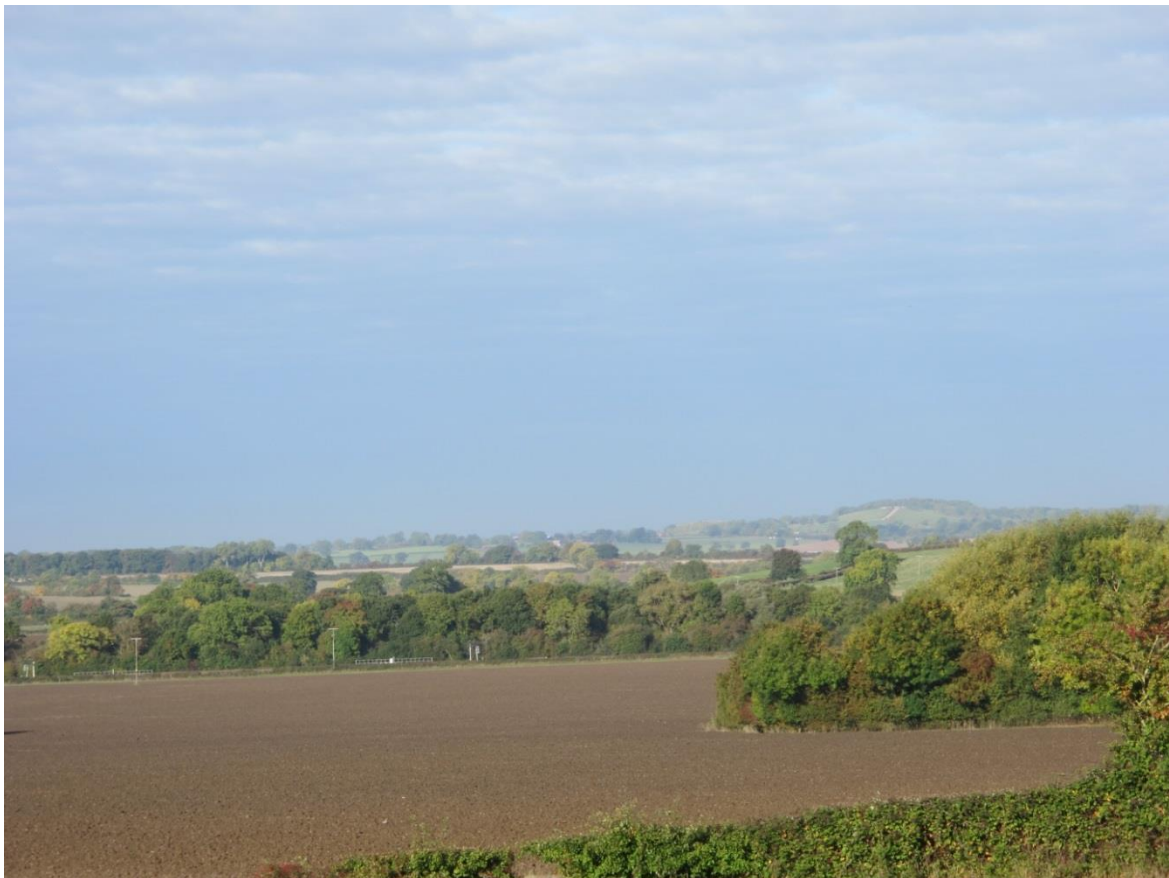
View from Pathlow looking North-West towards the railway line. Wootton Hill can be seen in the distance.