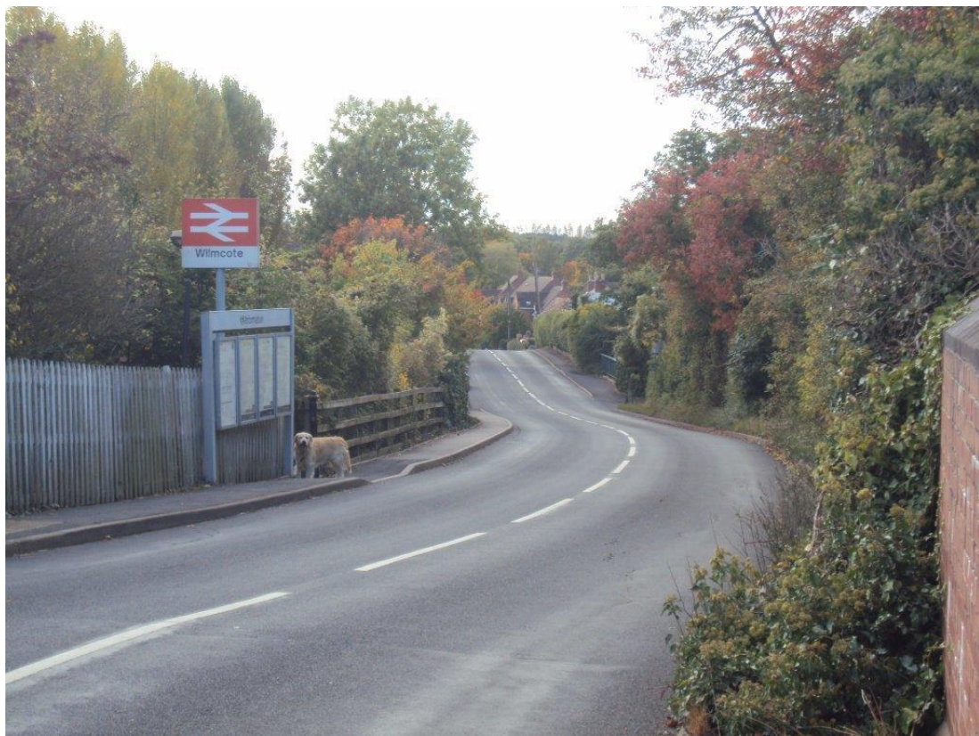
Featherbed Lane approach to Wilmcote, ahead is the canal bridge.